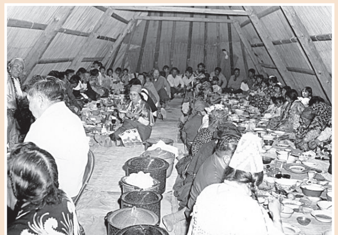
A salmon feast at a tribal longhouse. Salmon and water are the first of the First Foods. In the spring, when the tribes celebrate the salmon's return, tribal longhouses and churches must have spring chinook—no other fish will do—for their First Salmon ceremonies.

To jump-start the program, the tribe released surplus Umatilla and Ringold adult spring chinook